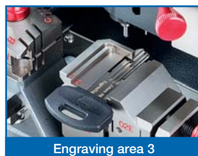
Engraving area 3