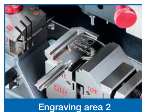
Engraving area 2