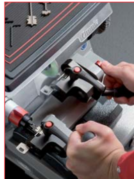
Smooth carriage movements

The integrated accessories area on top of the machine is particularly wide and capacious, allowing you to easily place accessories and keys. The incorporated tool holder dedicated to female keys tailstocks (optional) guarantees quick identification and immediate finding of the right accessory. Swarf collection in the dedicated tray,