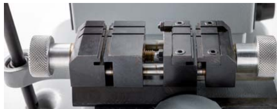
Replaceable jaws of the clamp on the cutter side