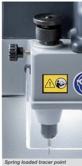
Spring loaded tracer point

The spring loaded tracer point, activated by rotating the locking nut, grants proper centering of cuts on the keys, ensures a perfect depth alignment and allows for adjustment to worn keys.