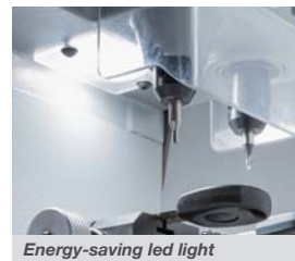
Energy-saving led light

The wide transparent shield protects the operator from moving parts, metal swarf and chips while cutting. The thermal magnetic safety switch turns the machine off automatically in case of power failures, safeguarding the machine itself.